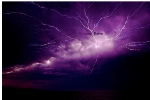
Kristen documented the stormy weather off the balcony of her cruise ship. This has sold quite well in one particular market...revealed in the program.

Kristen turned a hobby into a lucrative side income...and with our All Weather Front Door Income Opportunity you can, too.