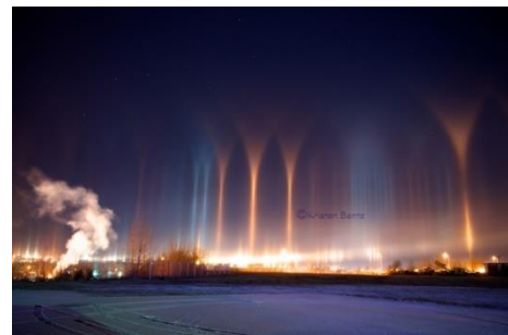
This shot was taken on the way to the airport. The photographer took this shot from the side of the road. She almost missed her flight!

After going through the All-Weather Front Door Income Opportunity, you'll learn how to sell an image of the weather from any activity... And who wants to buy them.